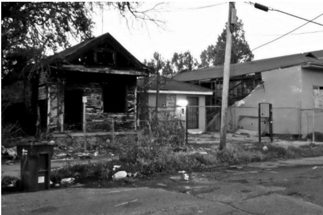
New Orleans, seven years after Katrina

“I get in line at the temp agency at 5 a.m. but if I’ve worked the last three days they cut me off, say it’s someone else’s turn,” was the lesson from a homeless mechanic in New Orleans, who once helped Coast Guard troops pull stranded neighbors off of rooftops during Hurricane Katrina. “I know I’ve made mistakes, but all I want is a job so I can get off the streets and pay my way.”