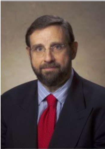
Harvey Pitt, 26th Chairman of the SEC (2001-3)

Traditionally, the CFTC oversaw markets in agricultural commodities like soybeans. Putting together massive international agreements on regulatory restructuring is something else altogether.