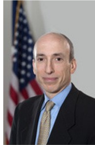
Gary Gensler, current Chairman of the CFTC

In isolation, the CFTC's difficulty in asserting its authority might not seem alarming. America regularly has disputes with even its closest economic partners. And some sources interviewed said Gensler should have known other countries don't like being told what to do. (A CFTC spokesman said Gensler wasn't available for an interview.)