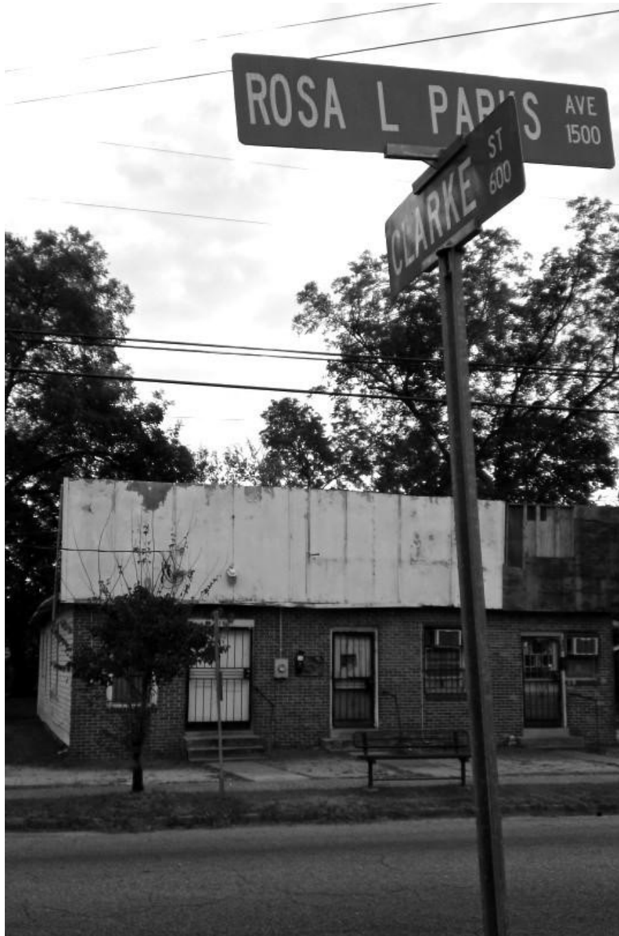
Poverty in the land of Rosa Parks, Montgomery

What did they have to say about poverty and our democracy? More than I could possibly do justice to here, but a few messages bear repeating in the final days of this election.