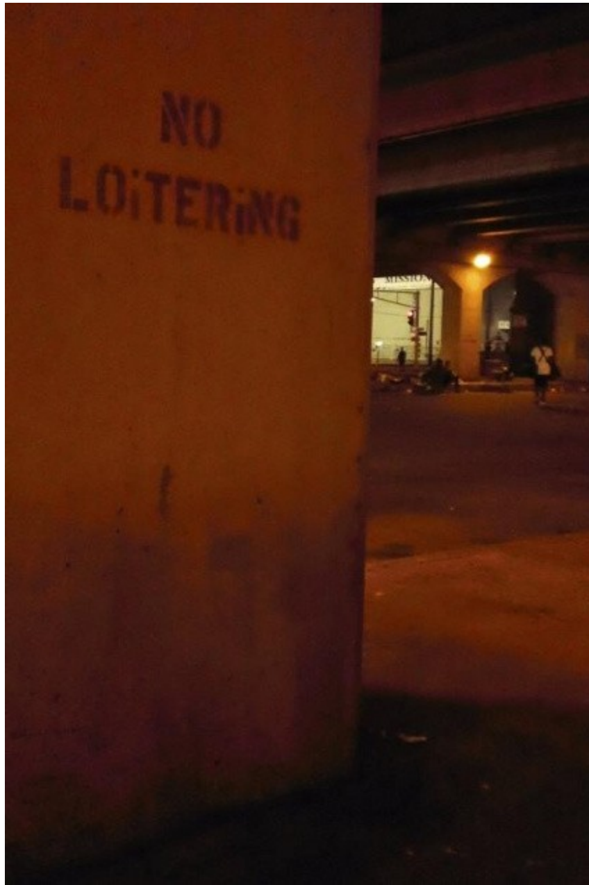
Home under Interstate 80