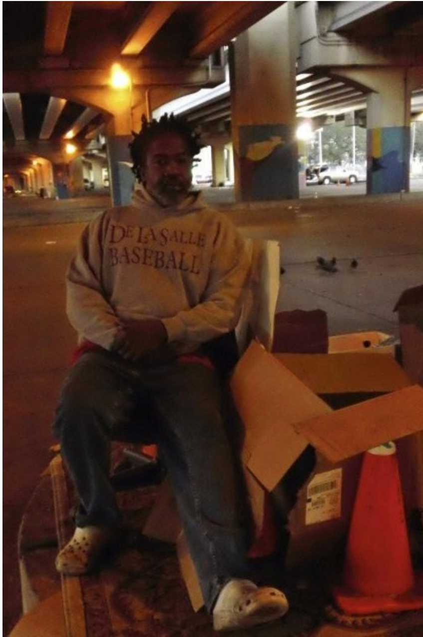
At home under the bridge in New Orleans

To my question about who determines the course our country takes, there was but one universal refrain: “American politics is all about the money.”