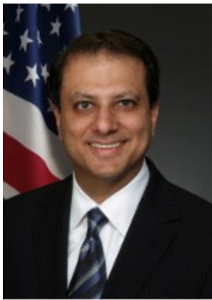
Mr. Preet Bharara, US Attorney for the Southern District of New York

But the settlement was thrown out late years by U. S. District Judge Jed Rakoff.